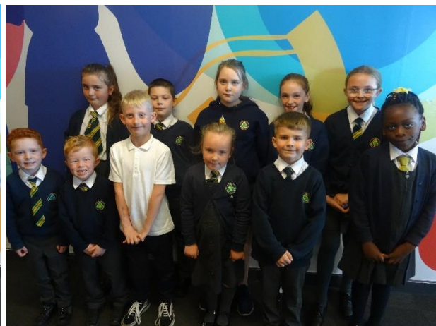
School Council Deputies