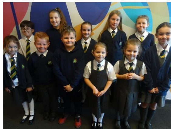
Junior Road Safety Officers (JRSOs)