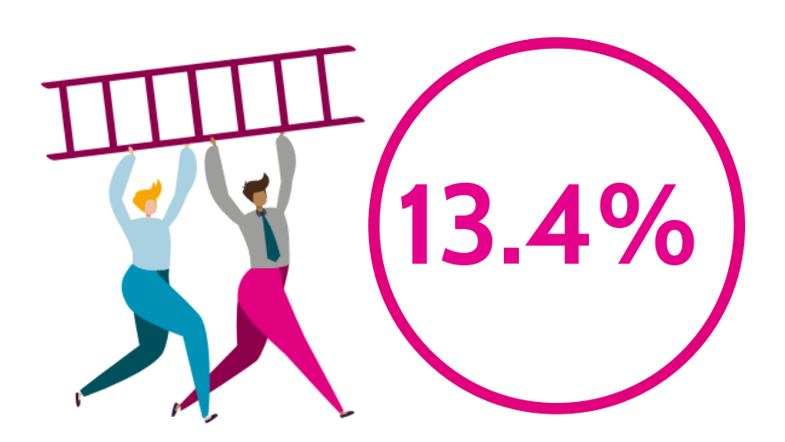
63,100 people in the region are self-employed